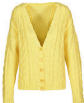
PRETTY FLOWER Pattern# 277-001-001

65% cotton (pima), 35% nylon 135m/50g NN 5-5.5