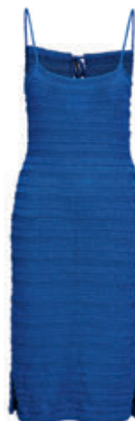
SEA LA VIE Pattern# 277-024-001