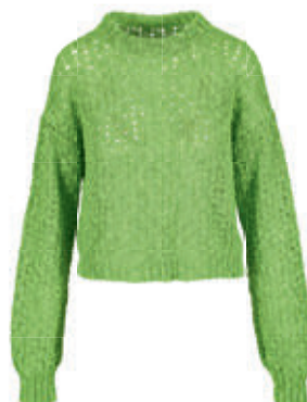
KEEP SMILING Pattern# 277-011-001