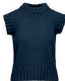
SUMMER DREAMS Pattern# 277-025-001