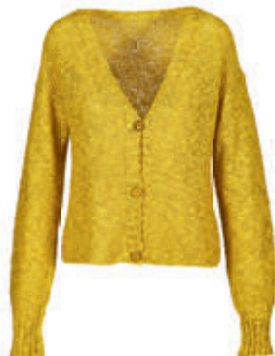
WILD FLOWER Pattern# 277-002-001

40% linen, 32% cotton, 28% viscose 280m/100g NN 3.5-4