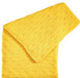
FIELD OF FLOWERS Pattern# 277-07-001