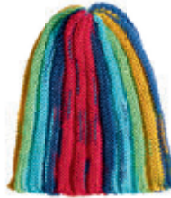
PURE MAGIC Pattern# 277-033-001