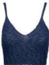
INTO THE TROPICS Pattern# 277-028-001