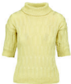
LEMON DROPS Pattern# 277-005-001

100% organic cotton (mercerized) 95m/50g NN 4.5-5