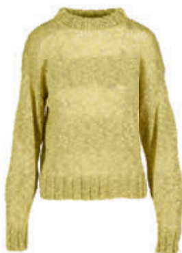
YOU ARE GOLDEN Pattern# 277-008-001