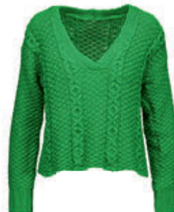
SEIZE THE DAY Pattern# 277-009-001