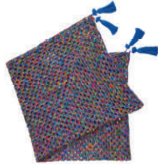
PARADISE FOUND Pattern# 277-034-001