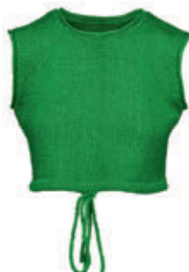
BE LOVED Pattern# 277-015-001