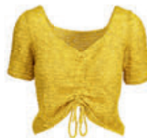
NO WALLFLOWER Pattern# 277-004-001