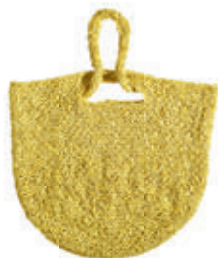
OOPSY DAISY Pattern# 277-006-001