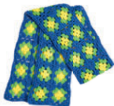
OCEAN BREEZE Pattern# 277-029-001