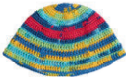
SUNNY SIDE UP Pattern# 277-032-001