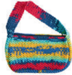
FEELING TROPICAL Pattern# 277-031-001