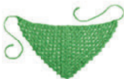
GOOD VIBES Pattern# 277-014-001