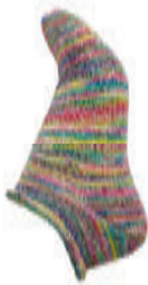
TROPICAL GETAWAY Pattern# 277-017-001

45% coton, 42% virgin wool, 13% nylon 400m/100g NN 2.5-3.5