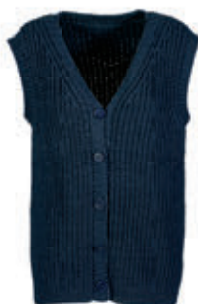
LITTLE WAVES Pattern# 277-026-001