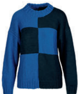
VITAMINE SEA Pattern# 277-021-001