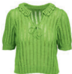
GRATEFUL HEART Pattern# 277-013-001