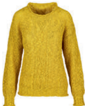
BLISSFULL BUTTERFLY Pattern# 277-003-001