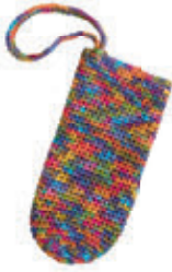
THIRSTY FOR SUMMER Pattern# 277-027-001