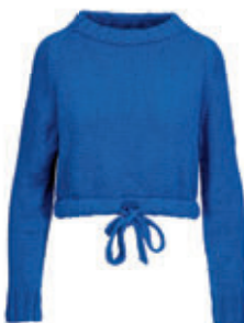
AQUAHOLIC Pattern# 277-022-001