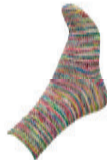
SANDY TOES Pattern# 277-019-001