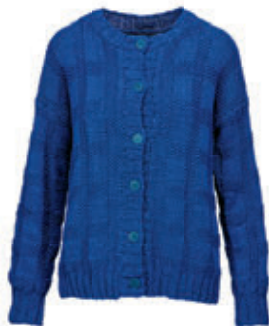
BIG WAVES Pattern# 277-020-001