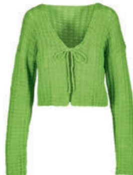
HEART AT PEACE Pattern# 277-012-001