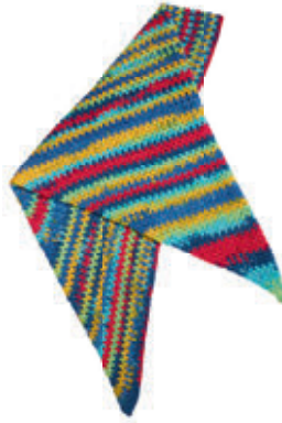
HEAT WAVES Pattern# 277-030-001