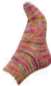
BEACH LIFE Pattern# 277-018-001