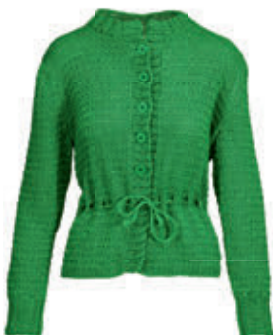
BE HAPPY Pattern# 277-010-001