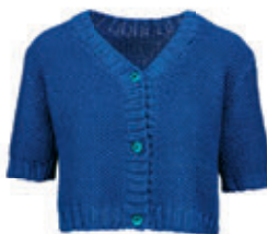
SEA STAR Pattern# 277-023-001