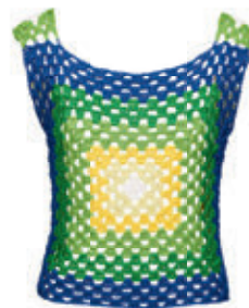
MORE MIRACLES Pattern# 277-016-001